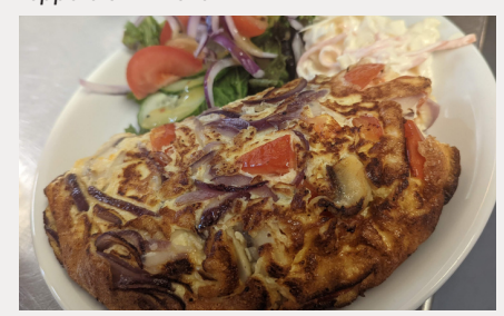
Add Extra Fillings From £1.20

Choose Two Fillings : Bacon, Sausage, Ham, Cheese, Mushroom, Peppers or Onions